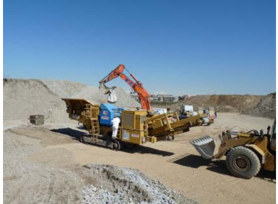
Fig. 1. The mobile plant

The evaluation of the finest content has been performed on the Torino underground railway muck, because of its high content of fine grained material.